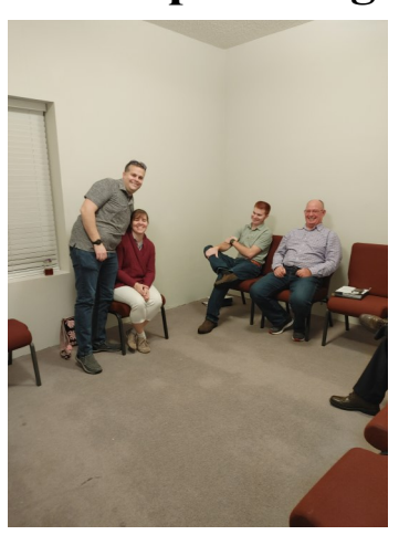
Thank you to the sweet folks at Westside Baptist for hosting.