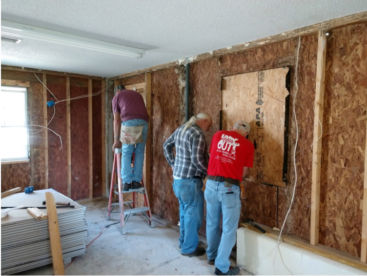
Men from Antioch Baptist Church helping Pleasant Hill Baptist with remodel and repairs to fellowship hall.